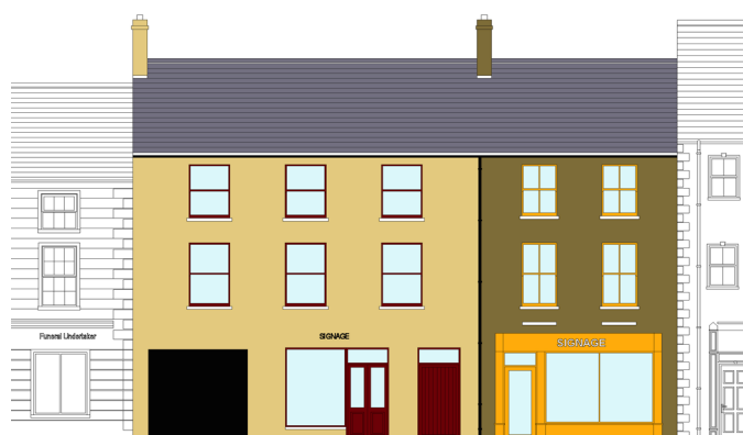
Infill Development Guidance