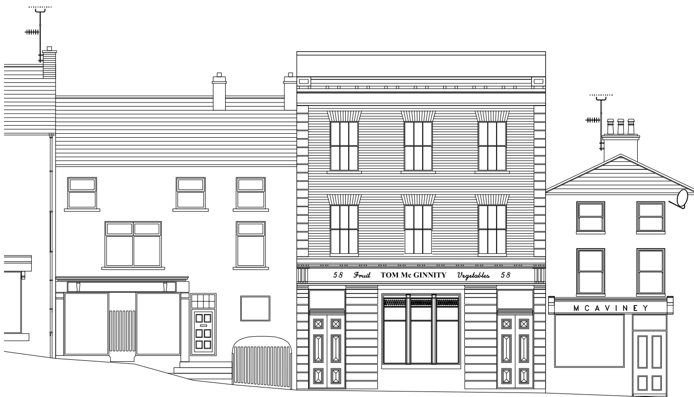
Building Typologies on Main Street

Historic Landscape Characterisation Plan Client: Monaghan County Council in Partnership with the Heritage Council Plan Preparation 2009 Adopted 2010