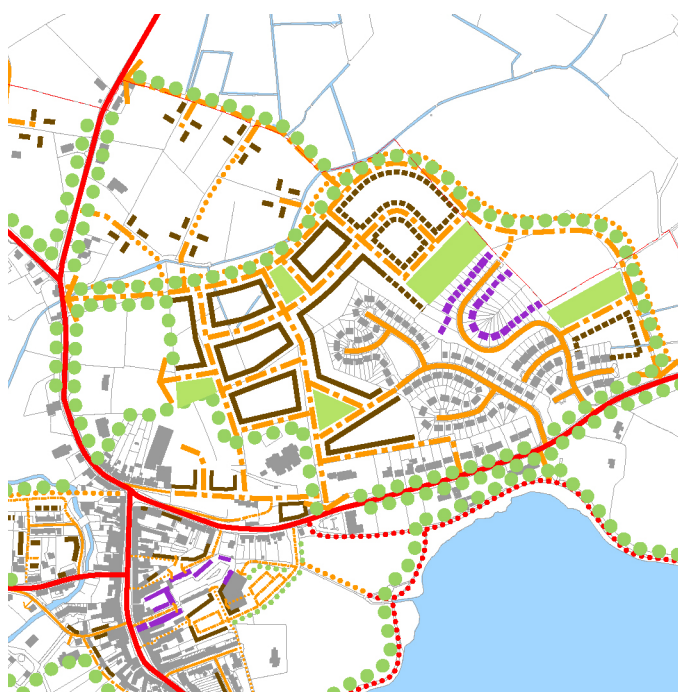
Extension of Existing Street Network